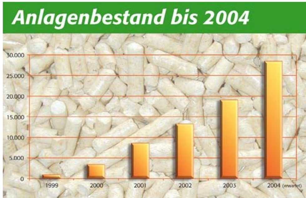
Figure 4: Number of wood pellets heating systems in Germany 17

The main consumers of wood from the forests are heat plants which use chipped wood. With a capacity of more than 150 kW they often supply schools and district heating systems. One of the oldest examples in Lower Saxony is the Training Centre of the State Forest Service in Seesen-Münchehof which since 1998 completely relies on wood chips from forestry for heating (190 + 145 kW). About 20 buildings in Leese are being supplied by burning wood chips from forestry, used timber and fast growing tree plantations. 18